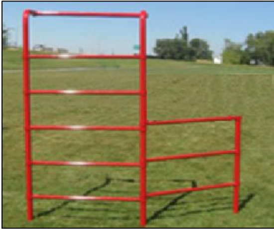
GROUND SPACE 7' X 2' COMMERCIAL PLAY SPACE 19' X 14'